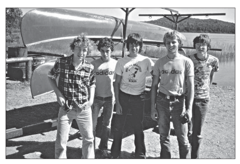
Author leading canoe trip in 1976 - Algonquin Park, Ontario

a person, and my character began to form as I developed physical strength and mental endurance. I also learned valuable social skills, like listening and compromising, as I learned to live in community.