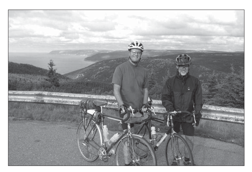
Author biking the Cabot Trail - Nova Scotia

In theological terms, the Bible is described as being "revealed" and "inspired" by God. The term inspired can be somewhat misleading if